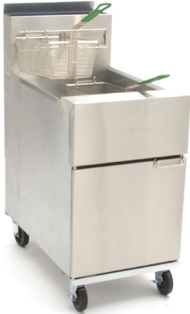
SR62G Shown with optional casters.